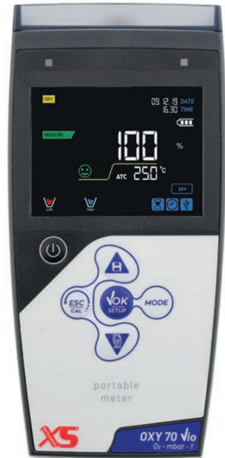
Only 6 buttons to easily manage all the functions of the instrument.